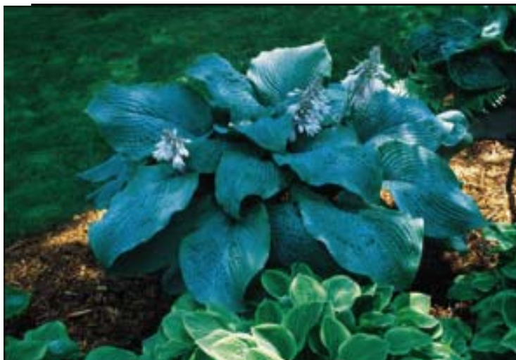
Hosta 'Blue Mammoth'