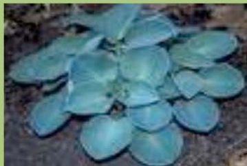
Hosta 'Blue Mouse Ears'