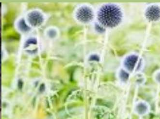
Echinops 'Taplow Blue'