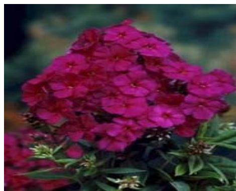
Phlox paniculata "Delilah"