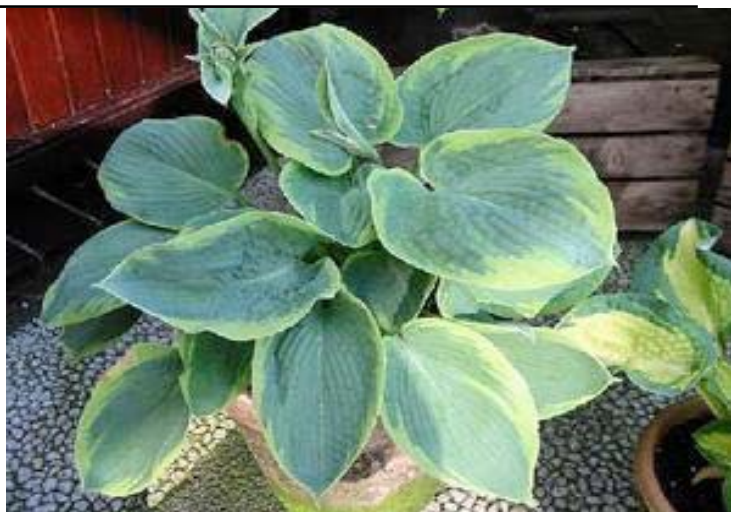
Hosta "Maple Leaf"

The Fredericton Botanic Garden Association Newsletter is published four times a year by the Fredericton Botanic Garden Association, Inc. The FBGA is a registered charitable organization for tax purposes.