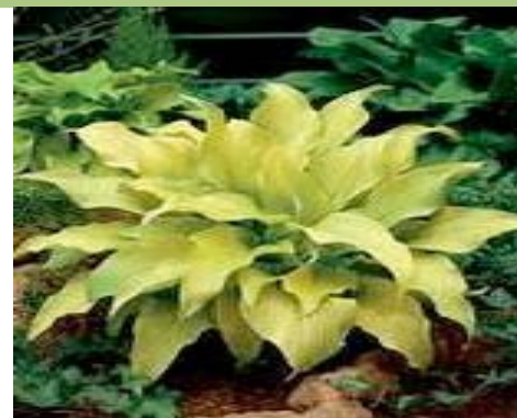
Hosta "Sun Power"