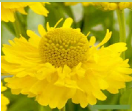
Helenium "Double Trouble"